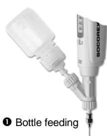
1 Bottle feeding