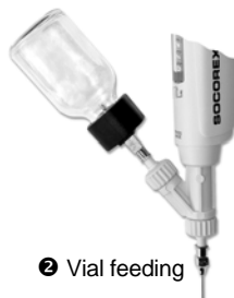
2 Vial feeding