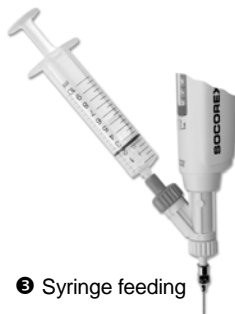
3 Syringe feeding