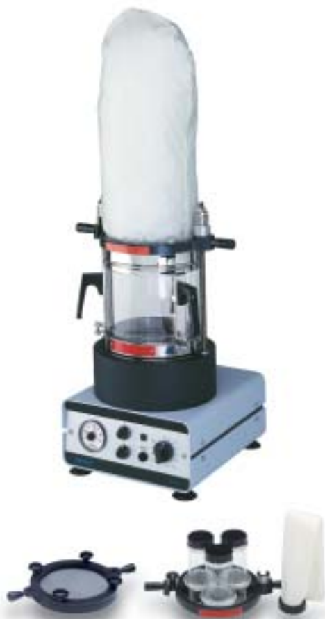
Clamping lid with filter insert

The attachment with 3 removable glass drying chambers (each 0.3 l) with filter hoses permits the simultaneous drying of three small samples of different materials under the same conditions. The bases are made of the same material as the larger chamber. Container lids with filter inserts are available as extra accessories.