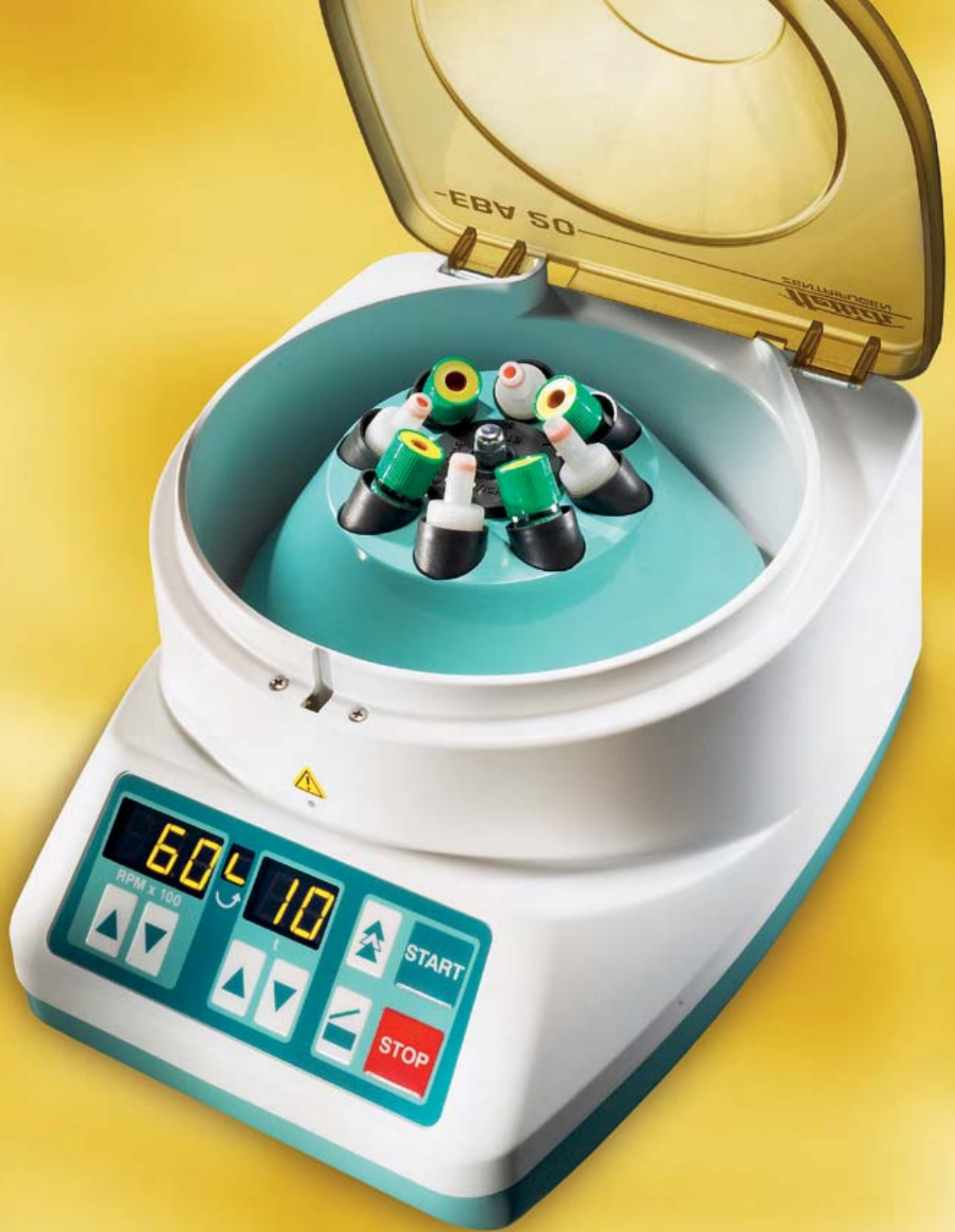
EBA 20 / EBA 20 S Small Centrifuges