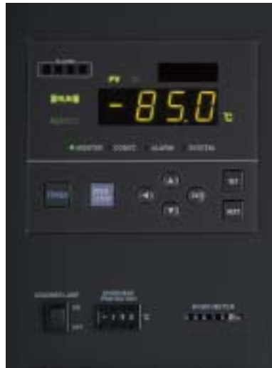
Constant operation type