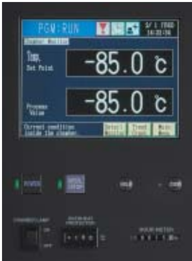
Programming operation type