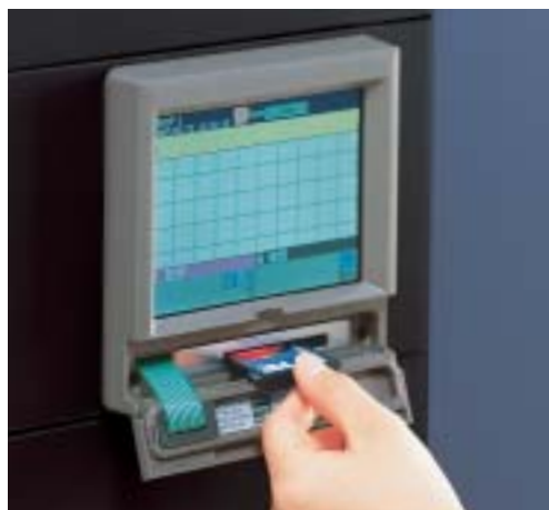
Paperless recorder (optional) *Sample photo