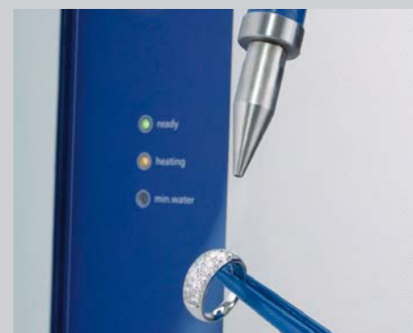
Cleaning of diamonds with fixed nozzle