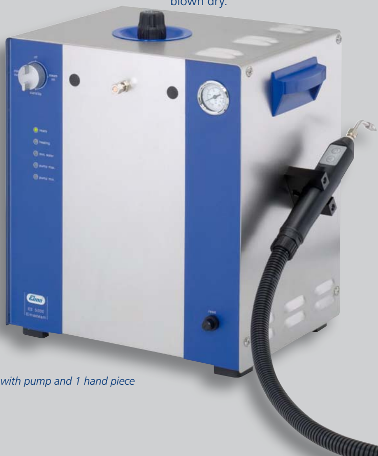
Elmastream 5000 with pump and 1 hand piece

(optional, instead of the fixed nozzle) is perfect for operating at the wash-basin. The handle carries only low voltage to ensure the safety of the operating staff. The operating keys are robust and leak-proof. The special plastic surface is conductive so that no electrostatic charges can build (the electric current is continuously branched off).