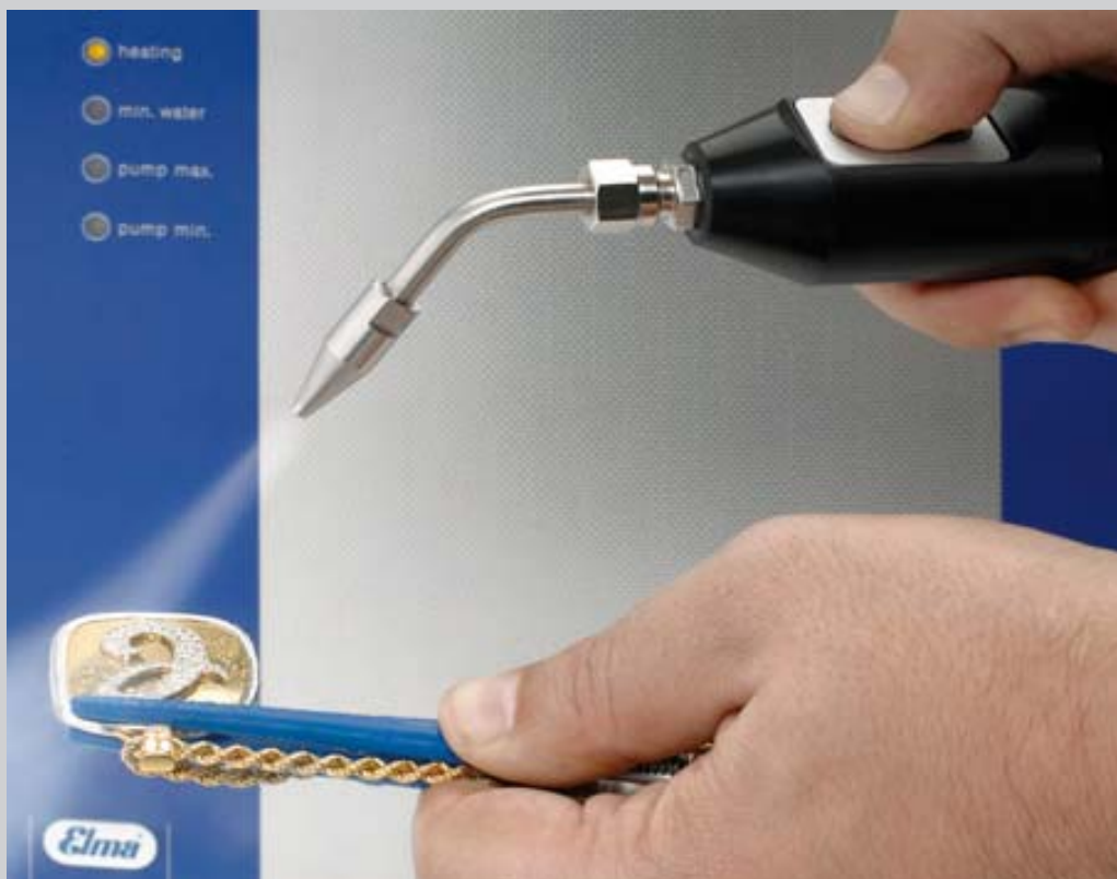
Cleaning of precious jewellery with the hand piece

perfect cleaning results without any chemicals, only with steam minimum waste disposal costs because of highly concentrated, small-volume waste