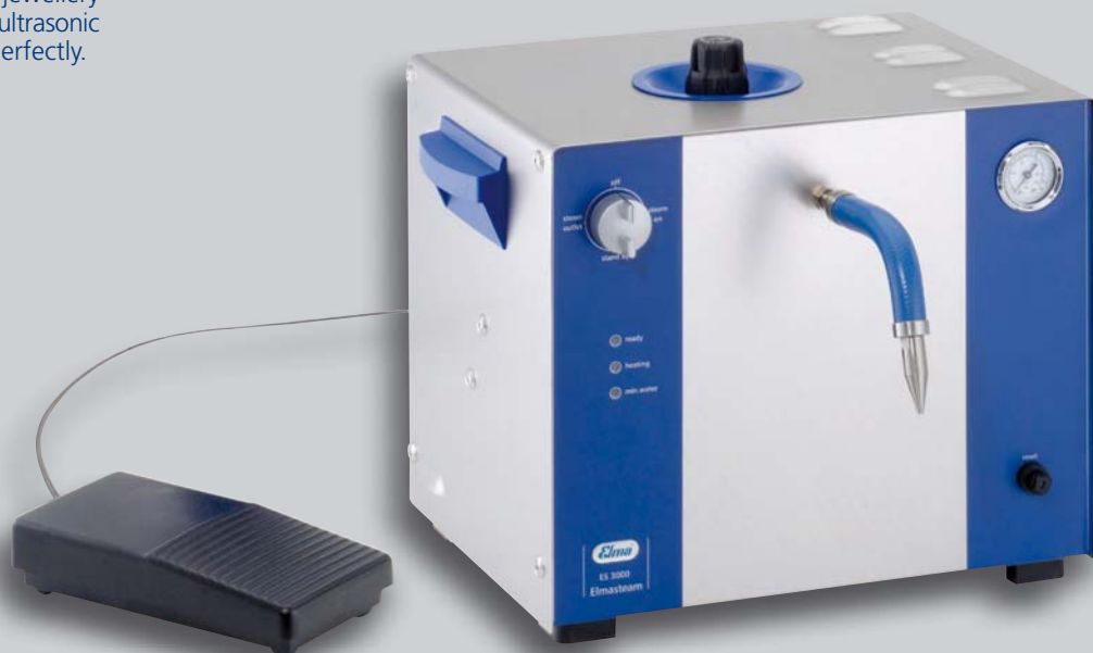
Elmasteam 3000 with fixed nozzle / foot activator

Why do the Elmasteam units operate at a pressure of 8 bar? The standard household steam cleaners operate at a pressure of only 3 to 4 bar. There is usually a significant pressure fall after only a few seconds. The Elmasteam 3000 and 5000 are units made for the professional use operating at a pressure of 8 bar. The high pressure remains constant over a long period and is relatively dry. relatively dry.