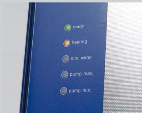
LED lamps on a unit with connected pump