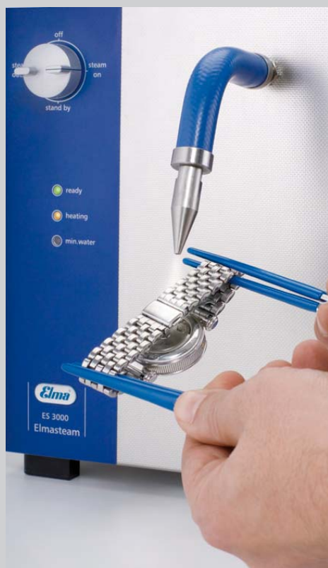
Cleaning of watch straps with fixed nozzle